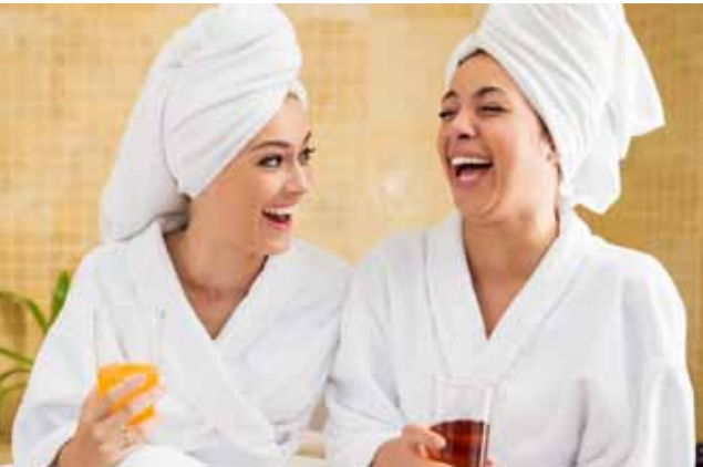
Girls' Trip takes on a new meaning at the state of the art Salamander Spa utilizing new techniques to restore, renew and inspire.

Rated as one of the "TOP 10 DESTINATIONS IN THE U.S.," ONE LUCKY WINNER will get a $1500 gift card towards a dream beach vacation at The Henderson Beach & Spa Resort on the Gulf of Mexico in Destin, Florida! In addition to world-class fishing, Destin offers uncrowded, sugarwhite beaches, spectacular open-air shopping, fresh local seafood restaurants and championship golf courses.